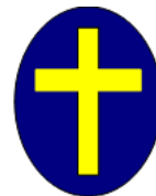
The Batt C.E. School